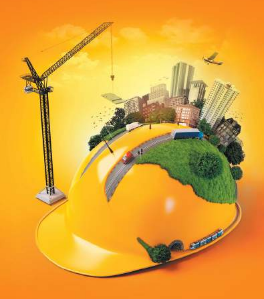
Be the Engineer & Technologist of tomorrow