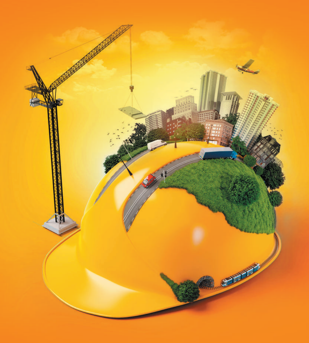
Be the Engineer & Technologist of tomorrow