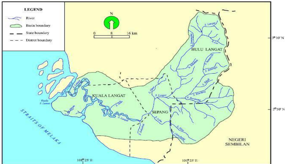
Figure 1: Map of Langkat River

In this research, five (5) rainfall stations have been analysed as shown in Table 1.