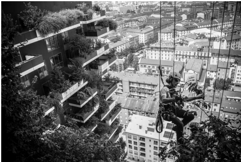
Figure 3: Landscaper working at heights