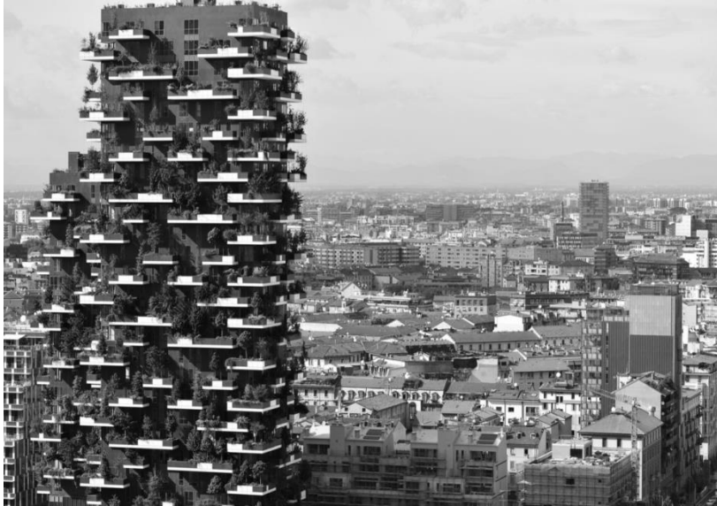
Figure 2: Bosco Vertical

the trees in the building to ensure that the occupants of the residential building had a normal living experience. These horticulturists are specially trained for this unique building and are required to work at heights during routine maintenance, as shown in Figure 3. From the support systems to the training of the professionals, Bosco Vertical's use of green infrastructure like vertical forests may seem like a good way to save energy, but it comes at a high additional cost.