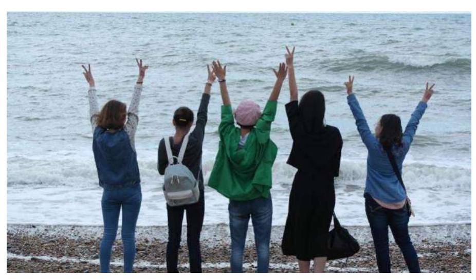
What will you do this summer?